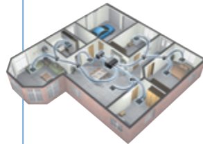
PACI FS MULTI